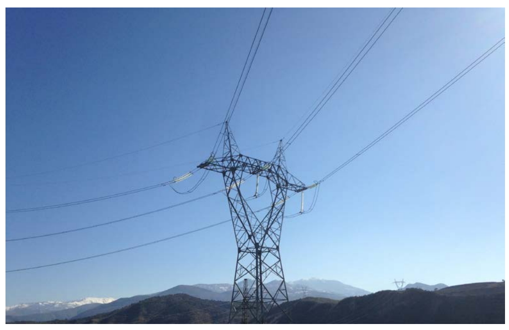
Existing 400 kV transmission lines in Elbasan, Albania.